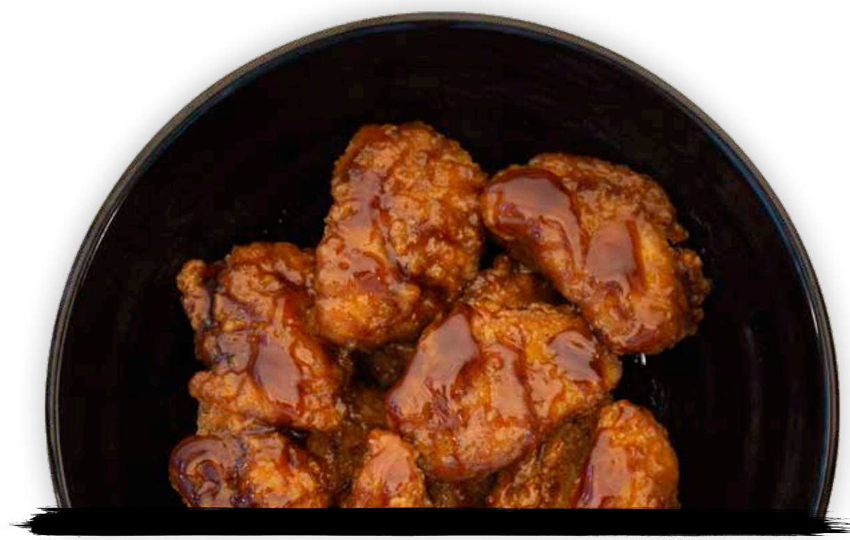
Boneless Chicken Wings BREADED 12 00 16 00 28 00 60 00 6pcs 10pcs 20pcs 50pcs

Served with your choice of 25+ AMAZING SAUCES