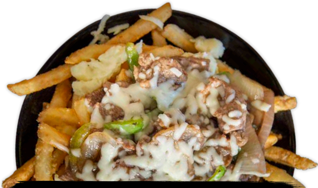
Philly Cheesesteak Poutine sliced beef, cheese curds, gravy, mushrooms, green peppers, red & white onions, shredded mozza 12 99