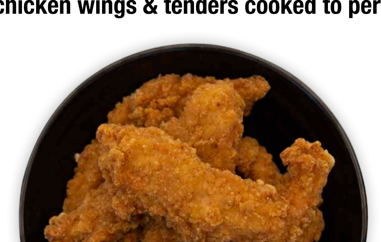
Chicken Tenders 12 00 20 00 5pcs 10pcs