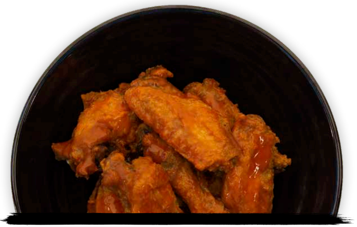
Chicken Wings BREADED OR NOT 12 00 16 00 28 00 60 00 6pcs 10pcs 20pcs 50pcs

Juicy chicken wings & tenders cooked to perfection.