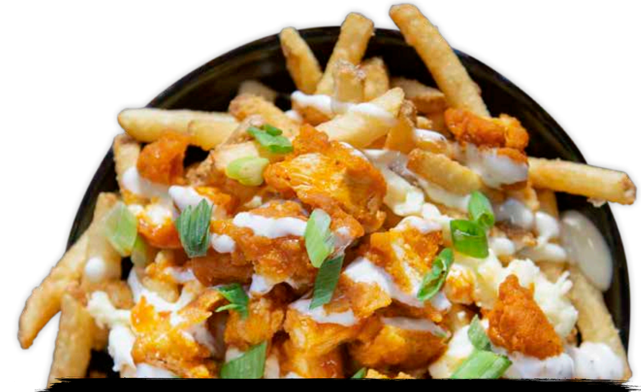
Buffalo Chicken Poutine fried chicken tossed in buffalo sauce, cheese curds, gravy, green onions and creamy ranch drizzle 12 99