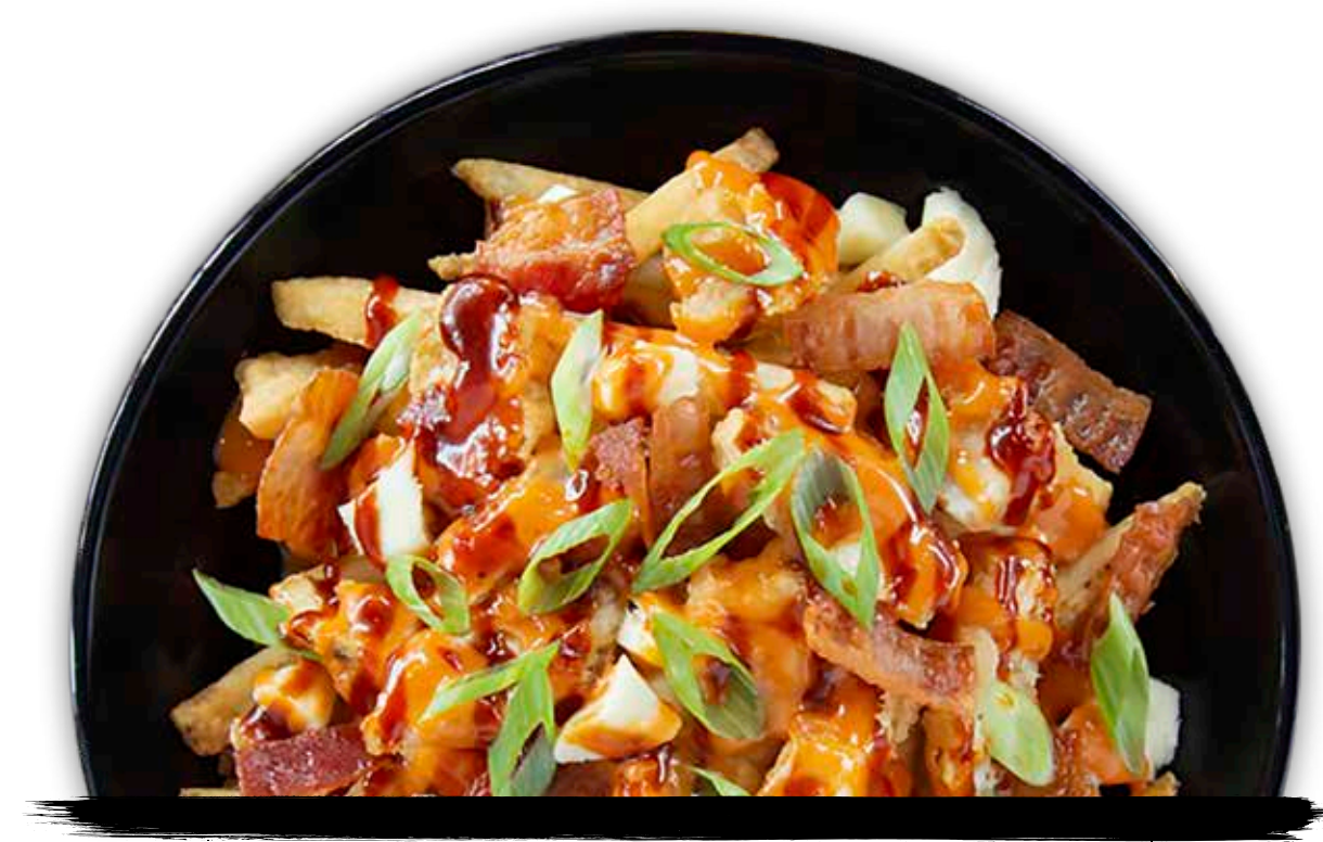
Fully Loaded Fries chopped crispy chicken, bacon, cheese curds, green onions, sweet bbq & sweet chili bang bang sauce 12 99