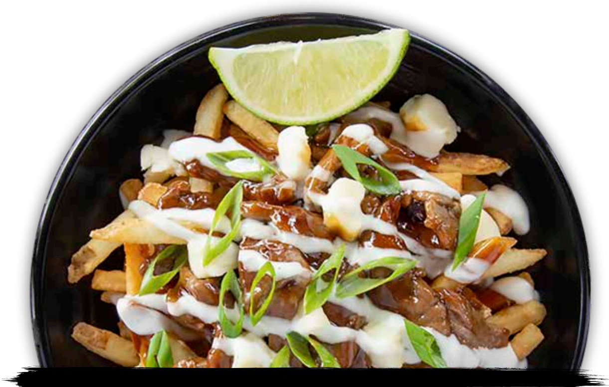
Tokyo Beef Poutine sweet teriyaki beef, cheese curds, lime aioli, green onions, lime wedge 12 99