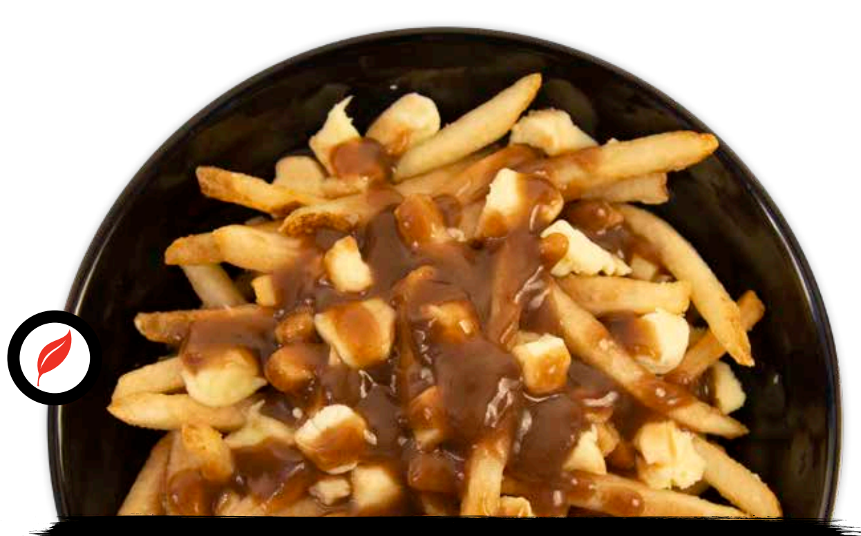
Traditional Poutine cheese curds, gravy 9 99