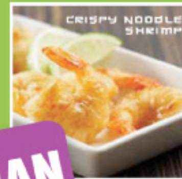
CRISPY NOODLE SHRIMP