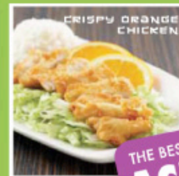
CRISPY ORANGE CHICKEN